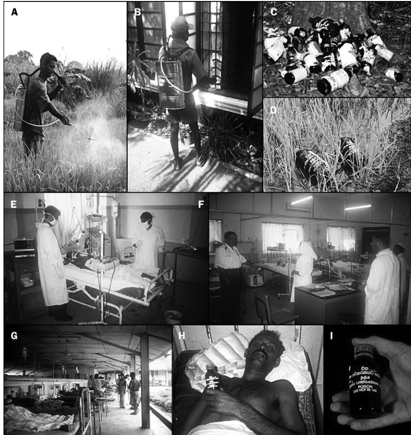
Figure 1: Causes and effects of pesticide poisoning

The pesticide industry states that it now fully supports a policy of restricted use of pesticides within an integrated programme of pest management. 19 However, its view of such management differs from that of some workers in that it perceives a clear need for pesticides in most situations. 20 Furthermore, its practice of paying salespeople on a commission basis, with increased sales being rewarded with increased earnings, is unlikely