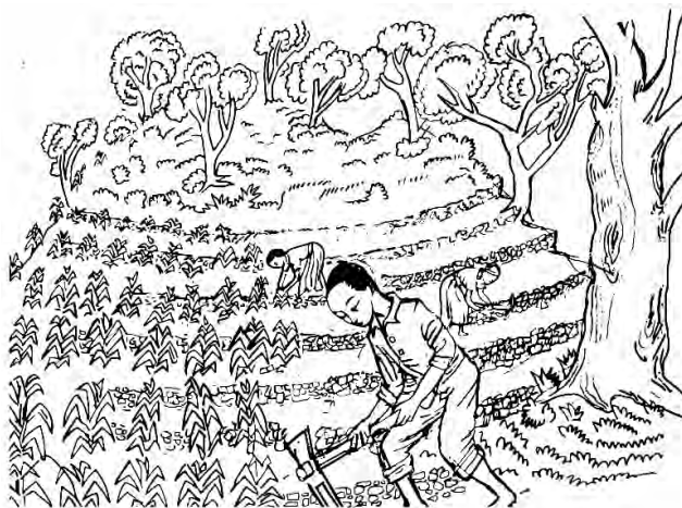
Fig. 1a. Conservation agriculture is an option to improve land and water productivity in Tanzania.

Conservation agriculture is any system or practice that aims to conserve soil and water by using minimum soil disturbance (conservation tillage) and crop rotation/association to minimize soil evaporation, which reduces runoff and erosion and improves conditions for plant establishment and growth. It involves planting crops and pastures directly into land, which is protected by mulch using minimum or no-tillage techniques. It is also used to increase organic matter content by improving soil structure and fertility, reduce reliance on cultivation, and achieve viable and sustainable productivity (Fig. 1a).